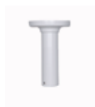
PB02 Pendant Mount